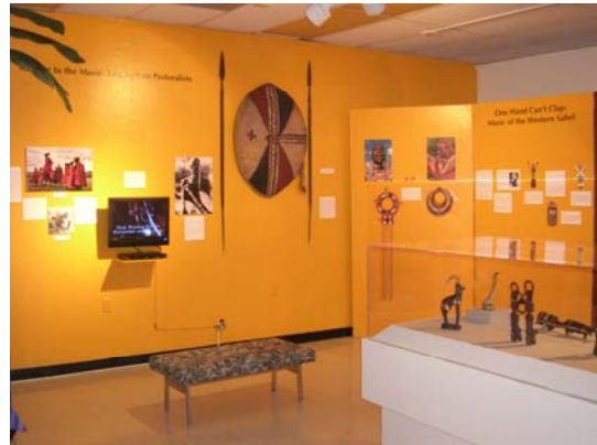
Images from the exhibit on the music of Africa, fall 2009.