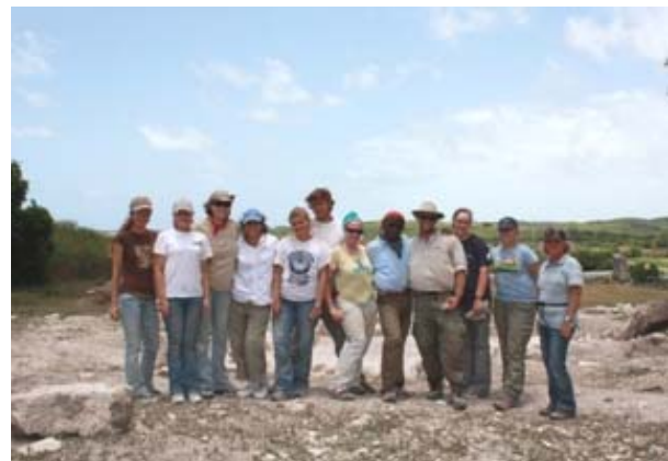
Betty's Hope Archaeological Field School, Antigua 2009.