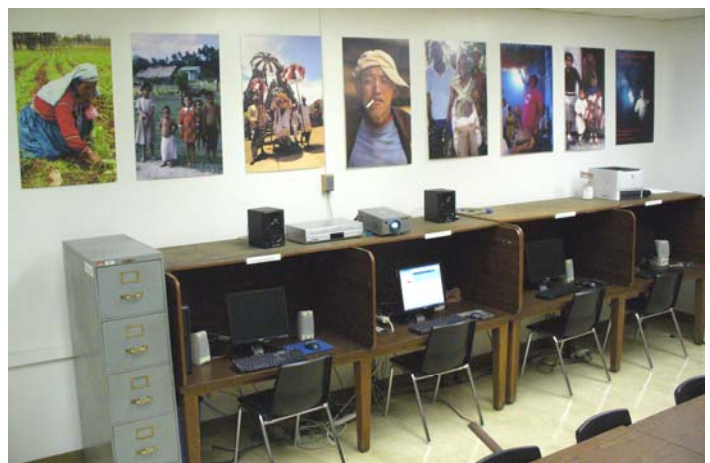
Anthropology Ethnographic Lab Butte 305, Photo by Dr. David Eaton.