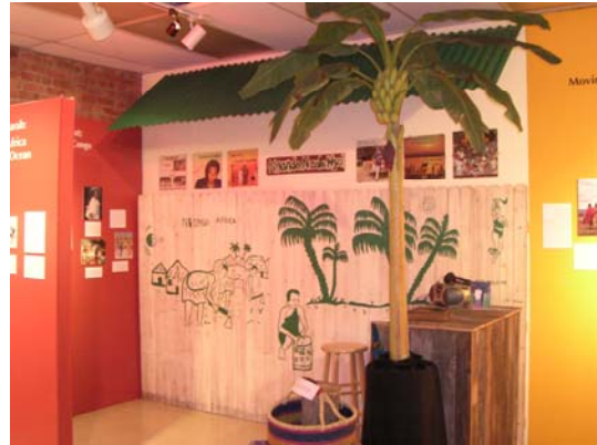
Images from the exhibit on the music of Africa, fall 2009.